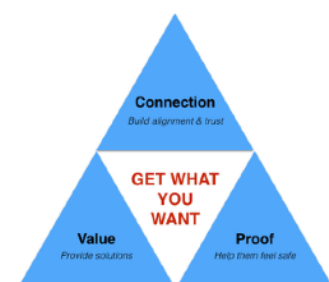
The Triangle of Influence